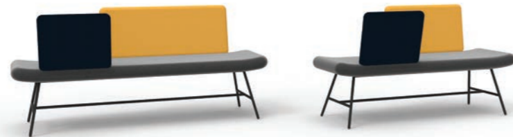
s483 - 04 LH