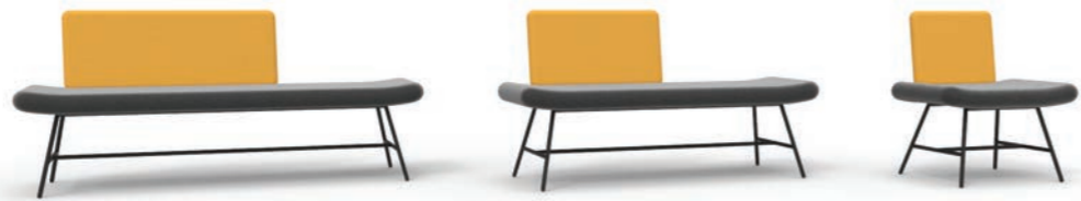
s483 - 02 RH