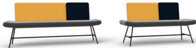
s483 - 03 RH