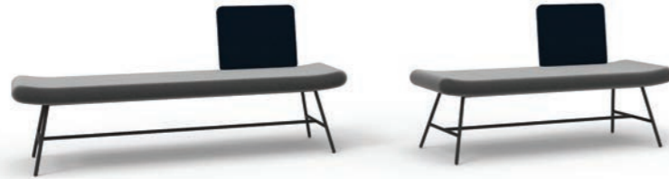
s483 - 01 LH